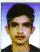
Vansh Abad 91.50%